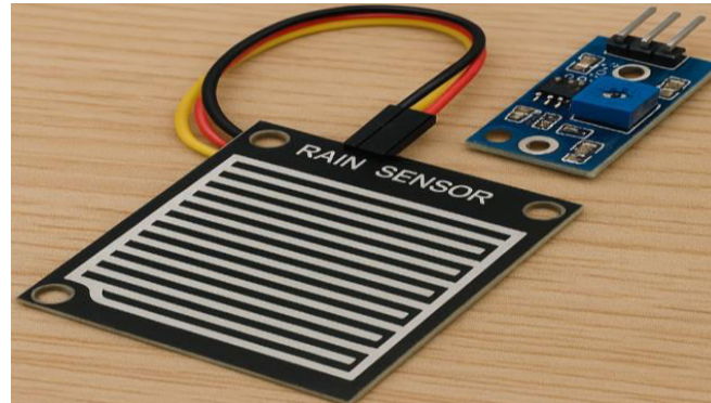
Fig. 4.2: Rain Sensor

(A Monthly, Peer Reviewed, Refereed, Scholarly Indexed, Open Access Journal)