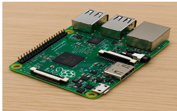
Fig. 4.1: Raspberry Pi

The Raspberry Pi is a low-cost, single-board computer with a processor, memory, USB ports, HDMI output, GPIO pins, and network connectivity. It uses a MicroSD card for storage and supports Linux-based operating systems, enabling execution of programs, sensor interfacing, and cloud connectivity. Its 40-pin GPIO header allows integration with hardware projects, including IoT monitoring, automation, and smart systems. Built-in Wi-Fi and Bluetooth support in newer models enables wireless data transmission. Its affordability, flexibility, and strong community support make it ideal for research, DIY projects, and industrial applications.