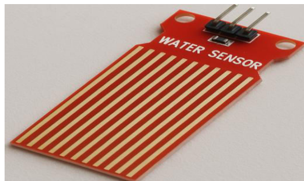
Fig. 4.3: Water Sensor

A water sensor detects water presence and levels by measuring changes in resistance across its metallic traces. The signal is converted to analog or digital outputs through a microcontroller. Water sensors are used in flood monitoring, tank level detection, leakage detection, and industrial automation. They are compact, low-cost, easy to interface, provide fast response, and often include adjustable sensitivity for varied environmental conditions.